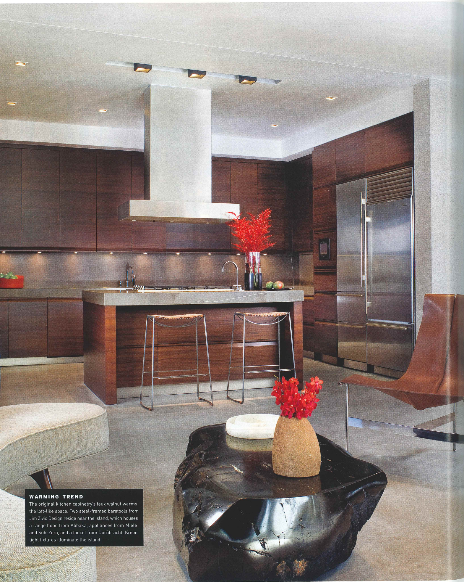
WARMING TREND The original kitchen cabinetry's faux walnut warms the loft-like space. Two steel-framed barstools from Jim Zivic Design reside near the island, which houses a range hood from Abbaka, appliances from Miele and Sub-Zero, and a faucet from Dornbracht. Kreon light fixtures illuminate the island.